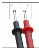
Measure AC voltage