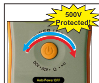
Anti-Burn Protection (ABP) on full range and up to 500V AC / DC !