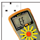
Non-Contact AC Voltage detection 'NCV' with audible and visible indication (MS-SD2 only)