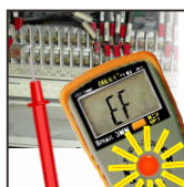
Single Probe Test 'SPT' to identify live wire in AC circuit (MS-SD2 only)