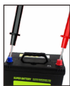
Measure DC voltage