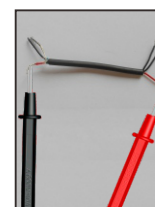
Continuity check < 50ohm beeps